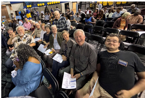
UPC at the TBR Unity 2025 citywide assembly of congregations and community organizations on October 22.