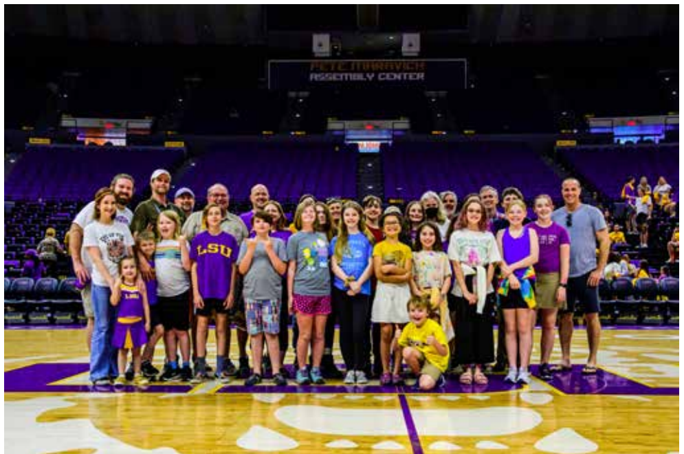
UPC Youth, their families, and advisors attended the LSU Women's Basketball game in February.