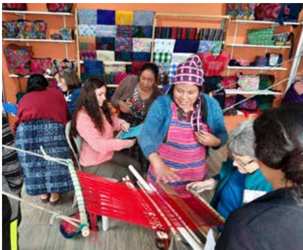
Weavers show visitors from Baton Rouge how to weave using backstrap looms in the weavers cooperative at Local Hope XELA AID.

Small Groups dates and times vary by class